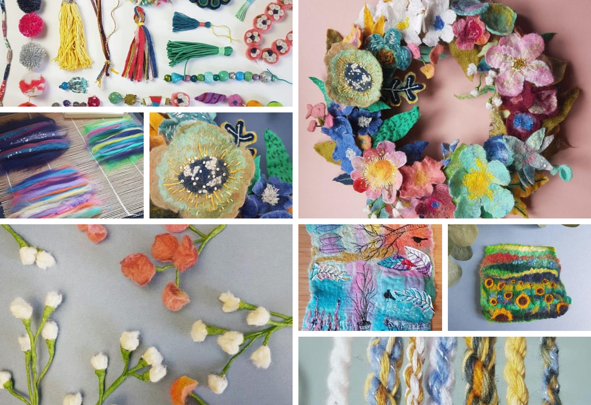
11. Felting Skill Stage 3 | School of Stitched Textiles